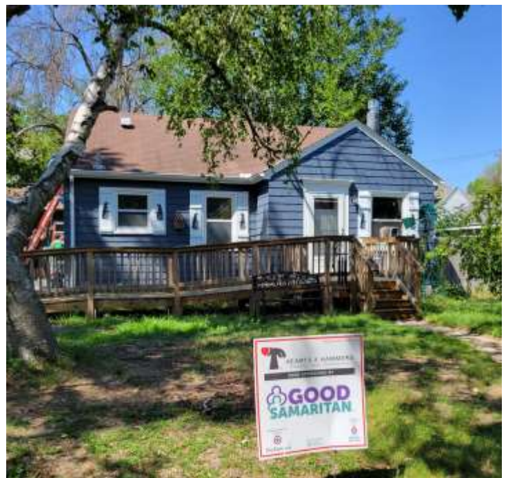
A job well done!