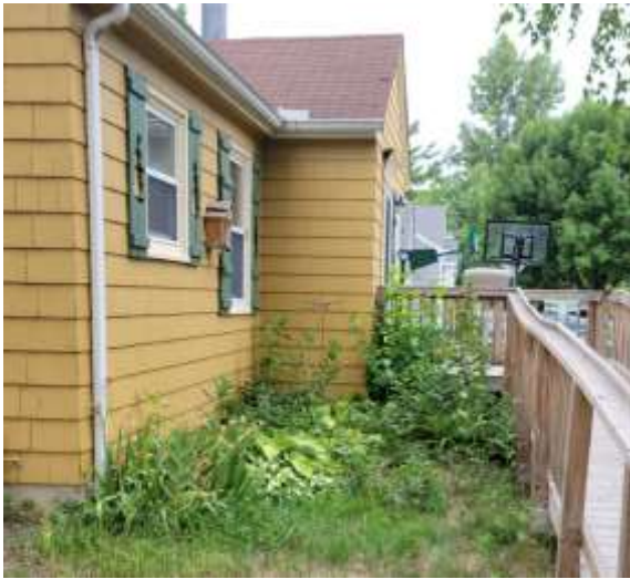
Before the work began