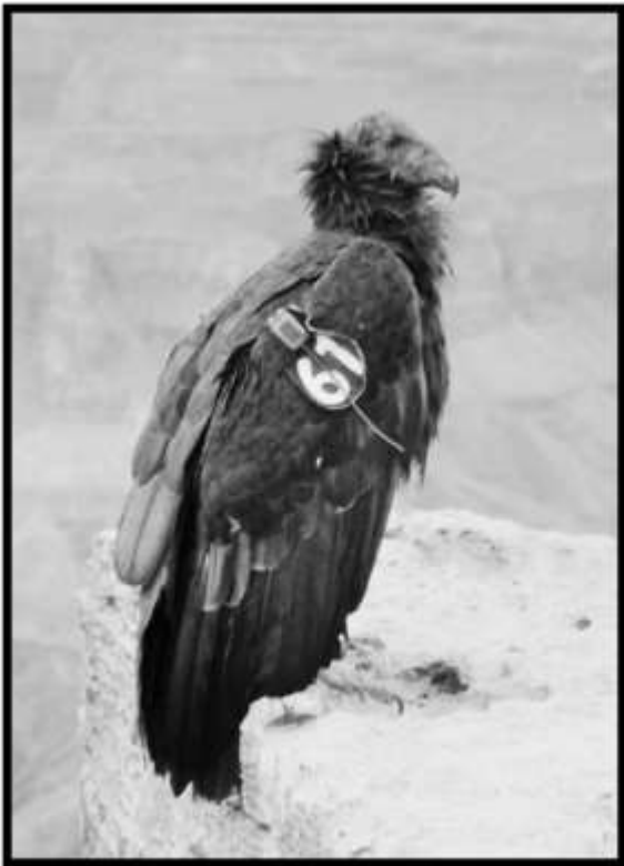
Endangered California Condor, Grand Canyon, 2014.

The prophet has forewarned King Hezekiah of a suspicious encounter with a foreign group. A diplomatic delegation from Babylon, a newly rising power, was welcomed in Jerusalem. Perhaps they were seeking a military alliance against an imminent threat. Hezekiah proudly showed them all his royal treasures. With prophetic insight, Isaiah warned of what would come tragically true a little over a century later: all that treasure and even the king's own descendants would be carried away into shameful slavery by the country in whom Hezekiah now placed his trust. And so it was; a little over a century after his death, Isaiah's prophecy of disaster was fulfilled.