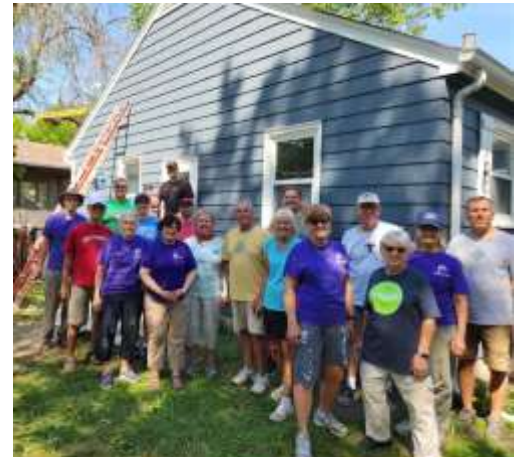
Photos from last year's project day - before and after.