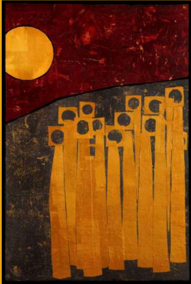
A Gathering of Spirits

November 24 - Gratitude Sunday / "Grateful Lives"