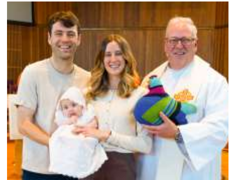
Sanctuary