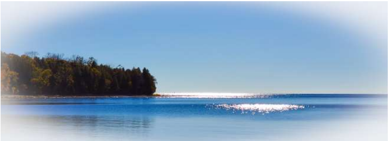
Peninsula State Park, Door County, Wisconsin.

For those who would claim that grace is a thing only in the New Testament, here is a passage which would challenge that assumption. The pen of Isaiah underscores the unconditional love of God centuries before Christ walked the earth. Here we hear of a personal God, one who will sacrifice and pay a high price for you. How much? How high a price? Answer: absolutely everything! You are worth the world to God, the whole of creation even! That's how much you matter to the one who created you, redeemed you, rescued you, and cares for you! If words alone aren't enough to convince you, consider the saving grace of God from the beginning of time (or turn to the back half of the Holy Bible and watch what God does through Jesus Christ for you!).