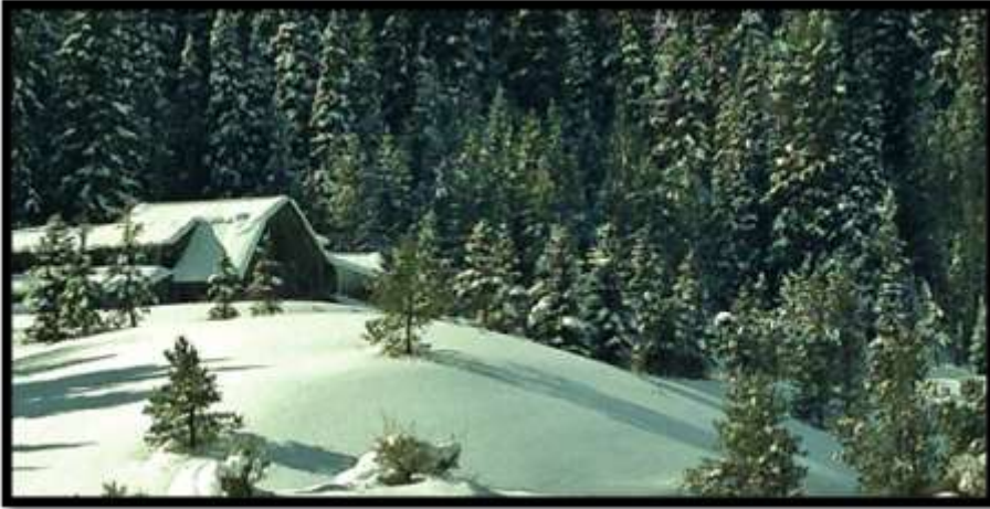
Crested Butte, Colorado, 2012