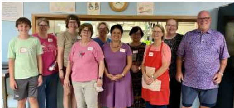
Our Simpson Volunteers, July 27:

With food insecurity on the rise, funds from our Easter offering have been donated to the organizations we support that help people with food in July and August. These include VEAP, Joyce Uptown Foodshelf, Meals on Wheels and The Wesley Foundation. We also prepared and served a meal at Simpson Housing Services in July (here's the crew!).