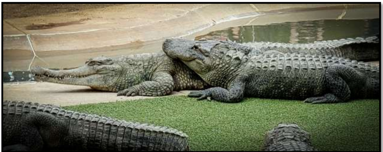
Crocodiles at Reptile Gardens, Rapid City, South Dakota, 2025

Omnipotent God, by following you, I receive your powerful protection. Help me to know when to use your merciful power and submit to my enemies. Amen.