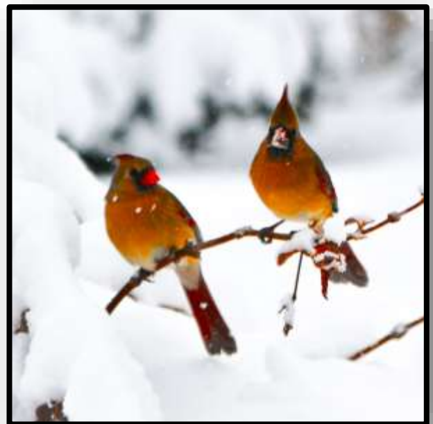
Cardinal in Winter, 2019

Almighty Lord, I am sorry that I hold back from giving you authority over my soul. You are faithful and true and never let go. Help my lack of devotion to be replaced by a steadfast trust in you. Take this soul that is drowning in the voices of temptation and let it overflow with trust in you. Amen .