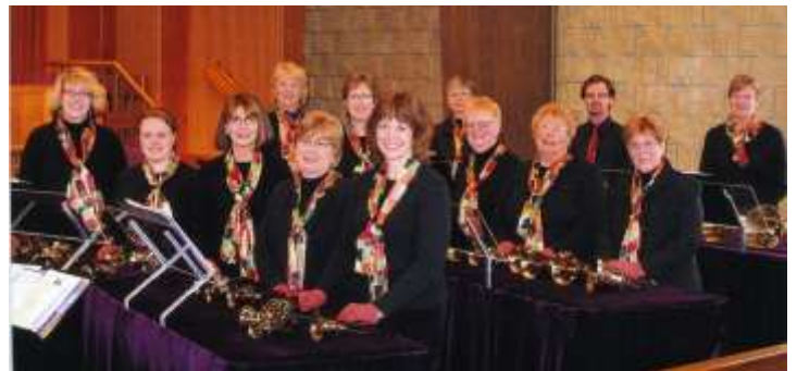
Chancel Chimes 2009